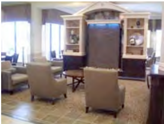
Hilton Garden Inn Lobby Lounge

I just came back from the Mid-south Regional Conference in Texas and got to stay at the Hotel where our April International conference is going to be. The Hilton Garden Inn in Lewisville, TX is 10 minutes from the airport (I promise) and brand new and darling! I kept feeling 300 quilters all around me and where you would be sitting, eating, talking, creating, dreaming and inspiring each other!